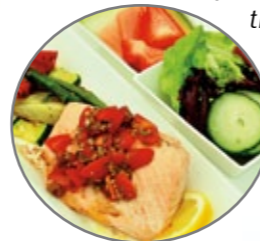
Order a gourmet lunch with a glass of wine

Step aboard our spacious yacht for a luxurious cruise through the rugged beauty of Barkley Sound. View the area’s abundant wildlife which includes whales, sea lions, seals, sea otters, black bears, eagles and many seabird species. We anchor for a gourmet lunch in the Broken Group Islands, then continue our scenic journey through the sheltered waters of this archipelago. Truly a cruise of a different nature!